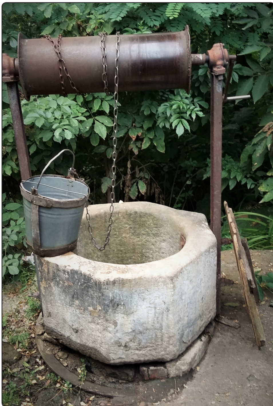
Poor access to water is the norm for Roma across Moldova, who often have to rely on untreated water sources like this one in the village of Bdiceni.