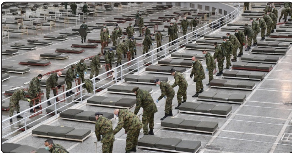
Serbian army turning an exhibition hall into a hospital for 3,000 patients, following advice from Chinese medical advisors to the Vučić government.

Considering the significant recent history of police brutality and use of torture in police custody against Roma in Serbia, the ERRRC is interviewing witnesses to determine if the officers’ version of events is accurate.