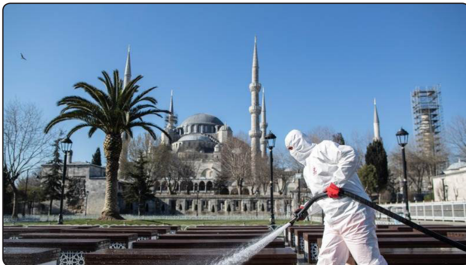
Municipal workers disinfect benches in the public square outside the Blue Mosque in Istanbul.

a report from their family doctor as they will be resting for 14 days. Even those who come out in front of the street will be punished by law enforcement officers who will work 24 hours on the streets. Stay home.”