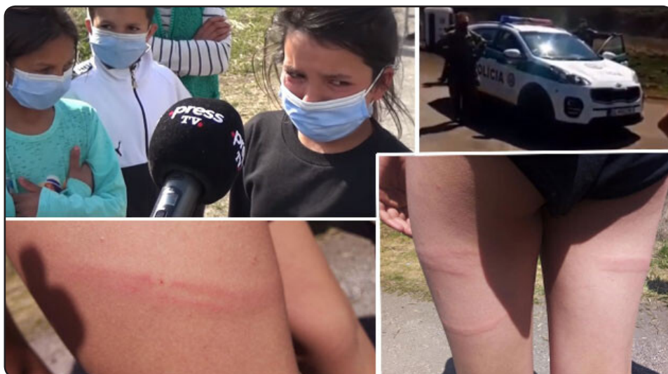
Truncheon marks on the legs of young children who were reportedly beaten by a police officer in the Romani neighbourhood of Krompachy, which was under quarantine.

In response the Ombudswoman stated that “Any disproportionate methods used by police or excessive use of force deserves to be condemned. I consider it unacceptable that violence be committed against children. Moreover, it is unacceptable for police to use force against children. Not even the pandemic can be a reason to use disproportionate policing methods.” She promised an investigation into the incident and to take a ‘comprehensive look’ at the issue of the quarantined settlements.