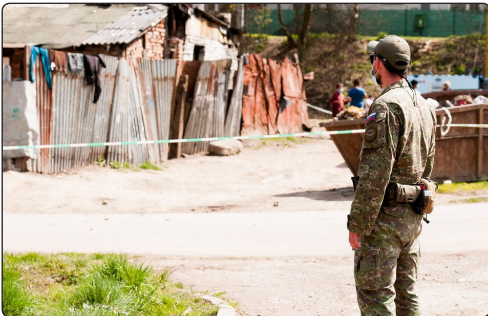
A soldier guarding the entrance to a Roma-majority neighbourhood under enforced lockdown in the Slovak Spis region.