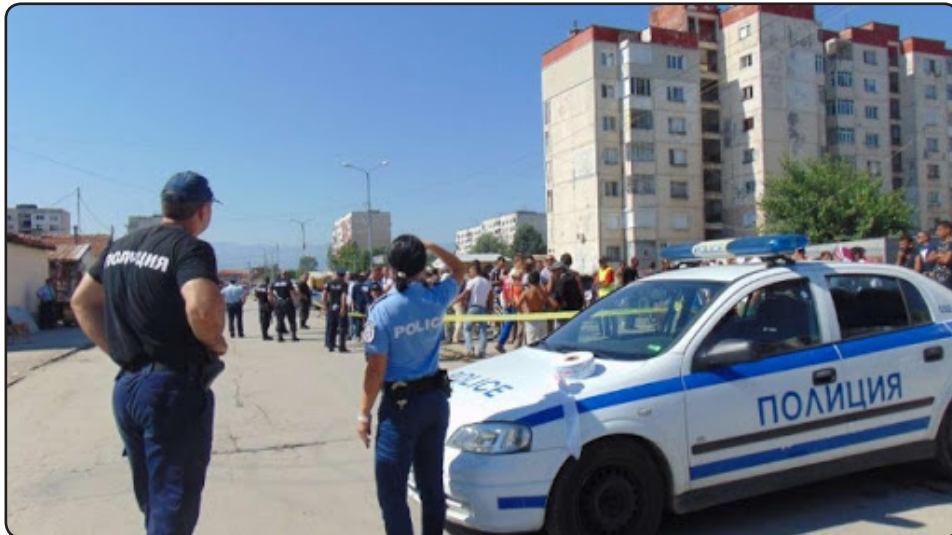
Police set up a checkpoint in the Roma neighbourhood of Plovdiv.

In contrast to the resources mobilized for drones, helicopters, checkpoints, and police reinforcements to secure and blockade Romani neighbourhoods, the government response to ameliorate the hardships and address the emergency needs of deprived communities during the pandemic was plainly inadequate. It is clear from the European Commission Overview of the Impact of Coronavirus Measures on Marginalized Roma Communities in the EU , that the communities were largely dependent on the efforts of about 200 health and education mediators, and the work of NGOs and other voluntary organizations in the field. For example, local NGOs established a coordination group, in which public health and educational mediators visited Romani neighbourhoods to provide information, monitor quarantine and refer people to specialists, distribute schooling materials for children, translate preventive brochures (15,000 printed), and support local authorities’ action to provide food, water tanks, IT equipment, and internet access for online learning programs.