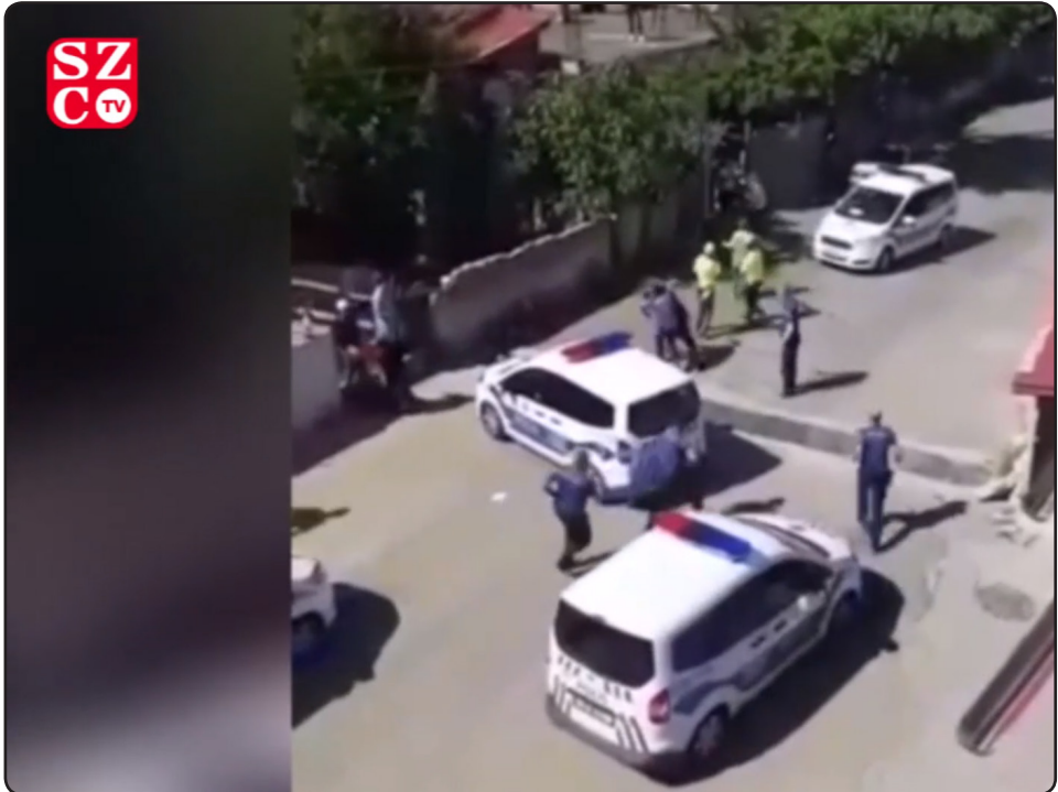
Police arrested and beat two Romani brothers who were sitting in their garden in Çorlu.