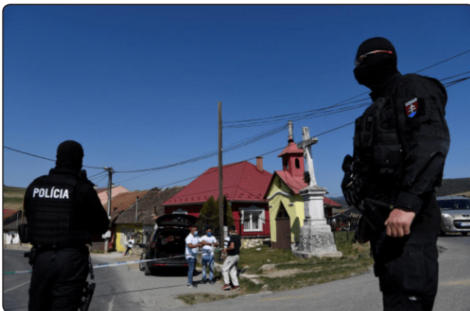
Police officers quarantine a Roma-majority neighbourhood in Slovakia.