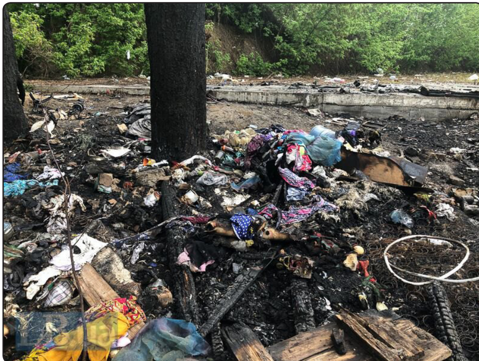
The remains of a camp where Roma from Zakarpattiya were living in Kiev, before it was destroyed in a racially motivated arson attack on 29th April 2020.

the victims to take their statements and open proceedings. Local community volunteers do not know where the victims are, as they moved immediately after the attack.