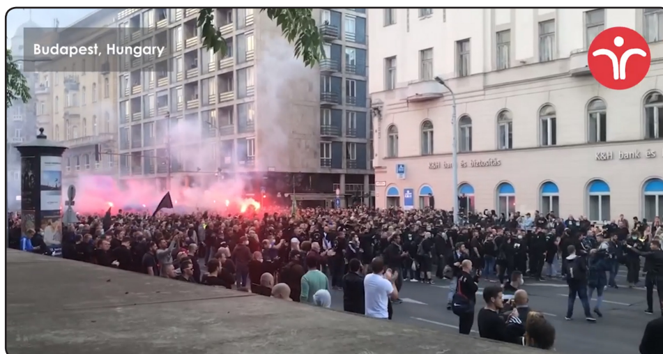
Far-right organisation Mi Hazánk staged an anti-Roma protest in the centre of Budapest on 28th May, defying the government ban on large gatherings.