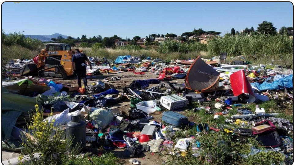
The aftermath of an eviction of a Roma camp on Via di Tor Bella Monaca.

Local activists and witnesses report police officers frequently visiting Romani families living in camps (as often as 4 or 5 times a week) to try and convince them to leave the area. It is highly probable there have been more evictions during the lockdown which went unreported while media attention was diverted by the pandemic. Furthermore, many evictions of small groups of Roma are termed ‘removals’ rather than ‘evictions’ and go underreported.