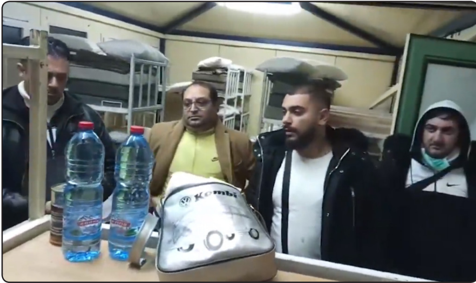
Romani musicians were the only people from a group of 200 who were quarantined at the Deve Bair border crossing on 17th March 2020.

The Minister of Defence, Radmila Shekerinska, later announced on her official Facebook page that all citizens coming from high-risk countries will be quarantined in the requisitioned army barracks in Prepeliste, until tests could be carried out to determine if they carried the novel corona virus. It only later emerged that the only people to be taken to the Prepeliste compound were a group of nine Romani musicians, belonging to the Orkestar Veseli Momci group, who had travelled from Salzburg, Austria to their homeland.