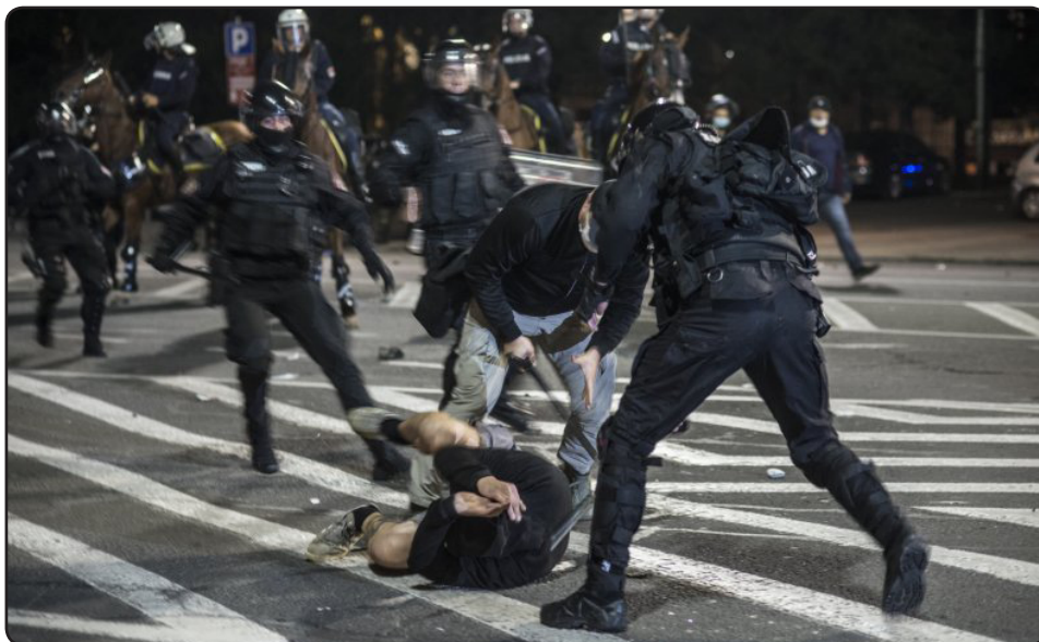
Police brutality against protestors in Belgrade is familiar for Serbian Roma who have dealt with police violence and torture for years, as well as during the emergency measures to contain the coronavirus.