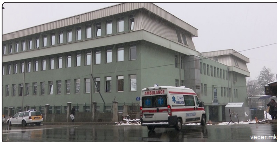
The hospital in Skopje where a 37-year-old Romani woman and her child died awaiting a Covid-19 test on 31 st March 2020.

The incident occurred after she had already been waiting for three days since her waters had broken for doctors to accept her at the gynaecological clinic at Ohrid and deliver her child. The woman came from a very poor background and lived in substandard housing conditions. She visited the clinic on several occasions complaining of extreme pain and showing signs of infection, but was denied treatment and sent home. The clinic neglected to treat her in a timely manner, considering the obvious complications she was describing. She was finally rushed to the emergency department in Skopje only to be left outside the hospital doors while they tested her for the Covid-19 virus. The Ministry of Health later confirmed that her results came back negative.