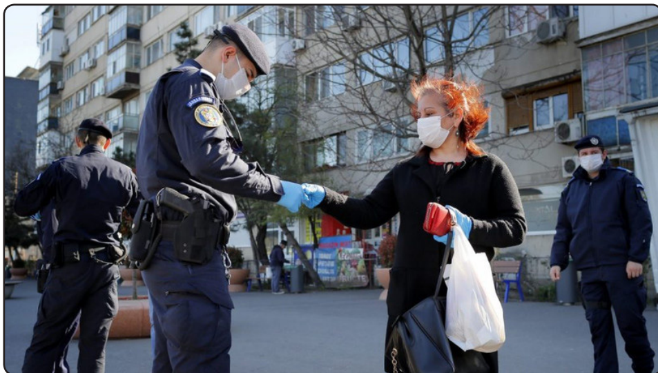
A police check during lockdown in Bucharest.