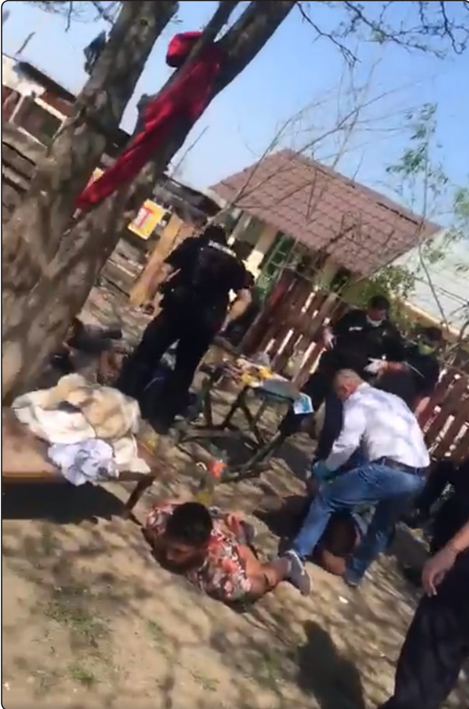
Roma in Bolintin de Vale were beaten by police officers while lying facedown on the ground in handcuffs for breaking social distancing measures.