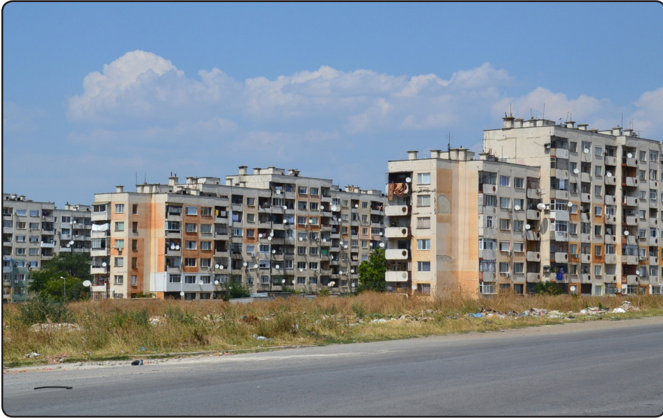
Georgi Benkovski neighbourhood of Yambol, the town where Roma were quarantined for weeks and disinfectant was sprayed by plane from overhead.