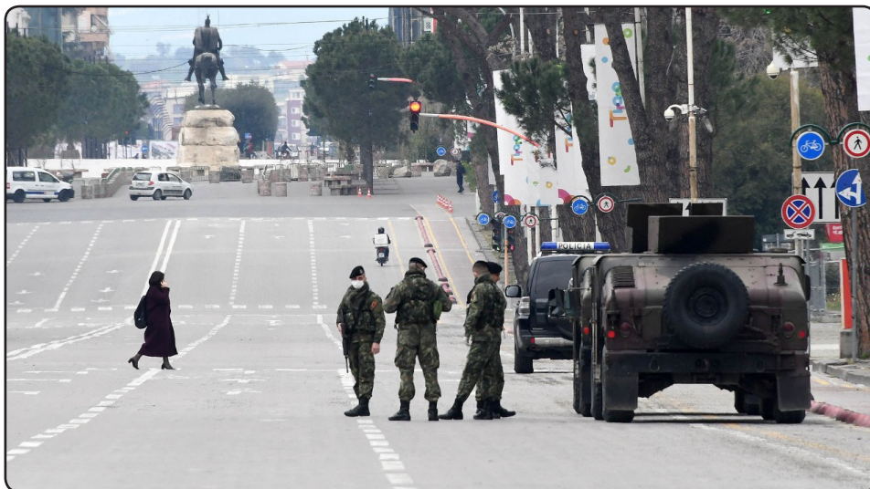
Albanian police and army enforce lockdown in Tirana, the country's capital.