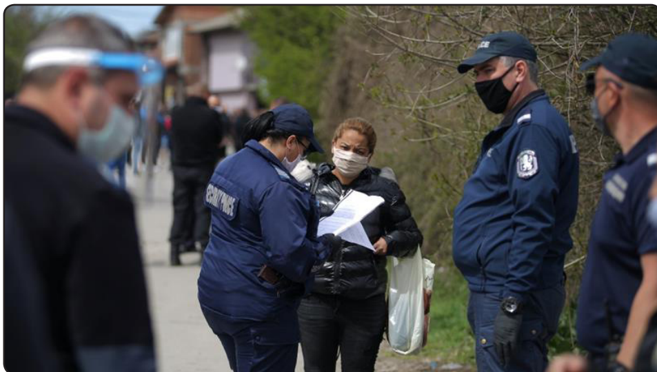
Police officers check the papers of a Romani woman in Sofia, April 17, 2020.