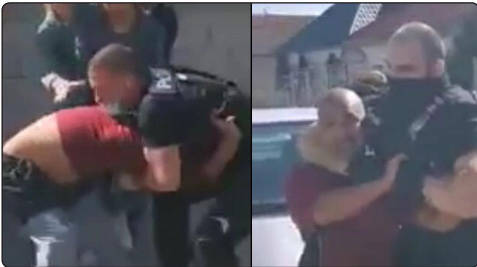
A police officer uses a choke hold during a confrontation with a Romani man who was smoking outside his house without a mask.

My uncle did not want to give himself up because basically they had no reason to arrest him. I would like to underscore that the officers did not use the standard arrest method of putting his hands behind his back and handcuffing him. They immediately shoved him against the car and twisted his arm. They pressed on his neck and my uncle was choking. What's more, the officers themselves weren't wearing the required face masks correctly either.”