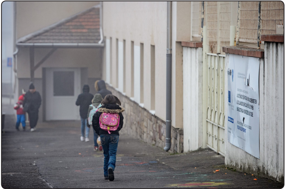
Romani children attending Nekcsei Demeter Primary School in Gyöngyöspata were the focus of international attention and a battle over the rule of law in Hungary.

a national consultation on the issue were sidetracked by the pandemic. However, by the time the state of emergency was introduced, the Prime Minister had succeeded in putting anti-Roma racism centre-stage in Hungarian politics through a series of polarizing broadcasts to the nation, further amplified by government-loyal media outlets.