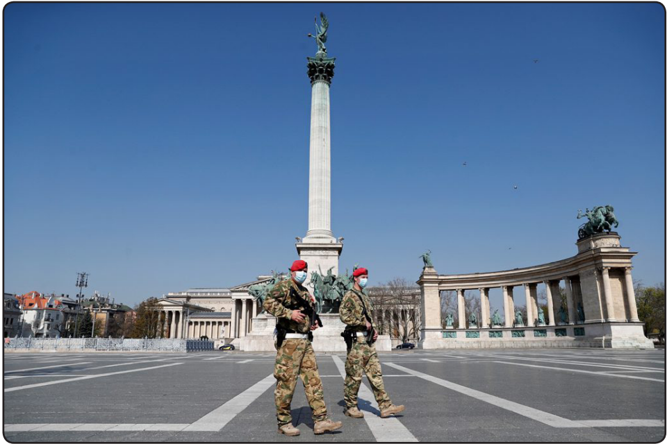
Soldiers patrol an empty Heroes Square in Budapest on 6th April 2020 during lockdown.