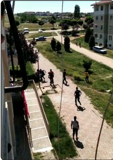
Footage taken from a nearby balcony of a confrontation between police and Roma during curfew in Keşan.

On May 24 th police teams entered Keşan's Mustafa Kemal Paşa District responding to a group of Roma who were reportedly violating curfew restrictions. According to local news, police officers battered a group of Romani citizens and used pepper spray on people, including children.